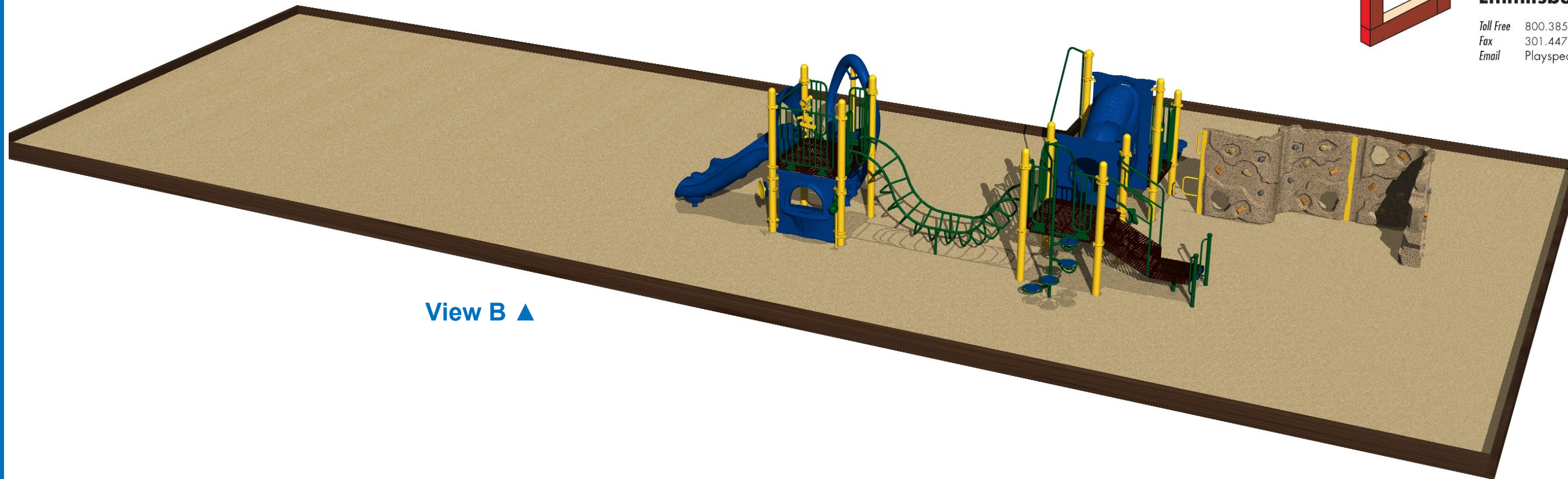
View B ▲

Toll Free 800.385.0075 Fax 301.447.3556 Email Playspec@aol.com