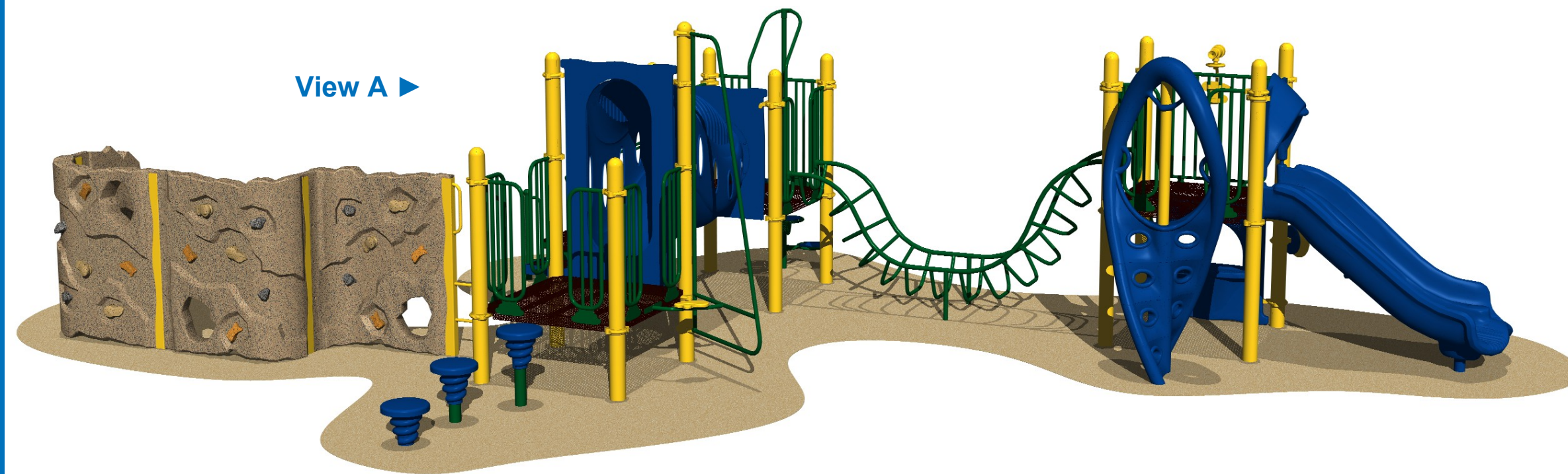
View A ►